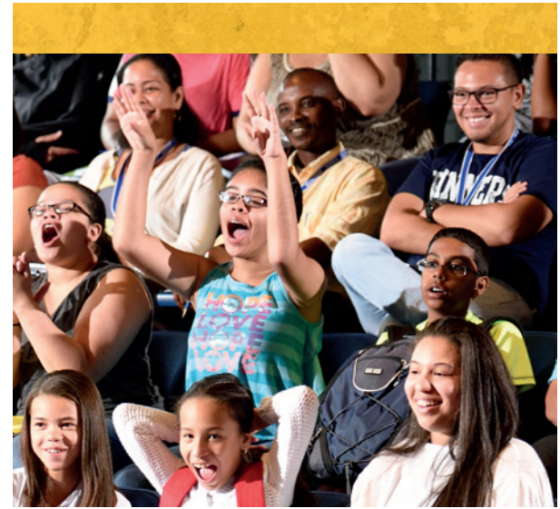
Teachers join students from the Lawrence, Mass., public schools for writing workshops several times during the ABL Writing Workshop for Teachers. Above, the crowd cheers for a teacher who shared her work at the open mic.